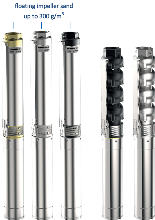
95 PR 95 PRX 95 PRG 95 REC 18 95 SX 18