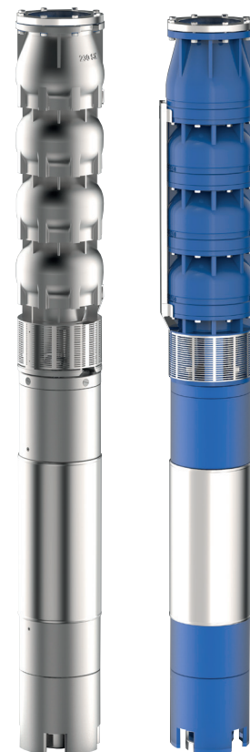
230 SX 230 REC