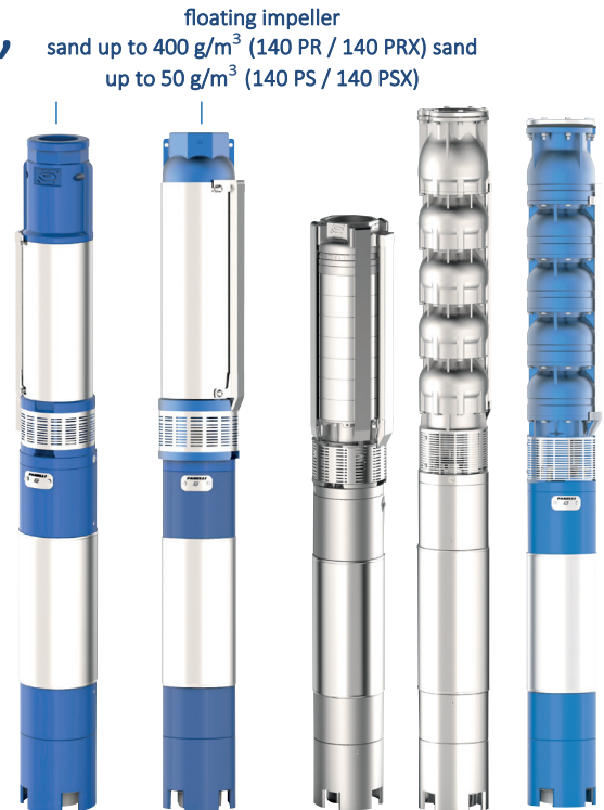
140 PR 140 PRX 140 PS 140 PSX 140 RX 140 SX 140 REC