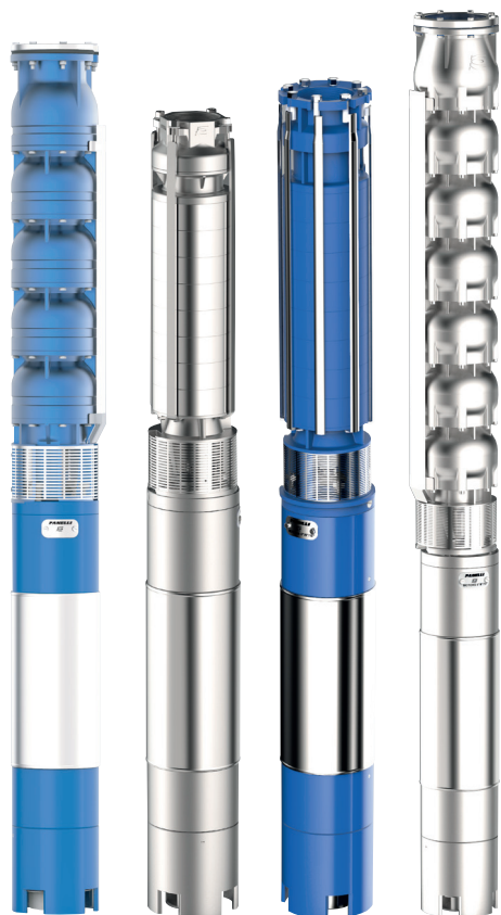
180 REC 180 RX 180 R 180 SX